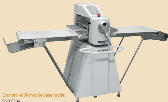
Econom 4000 mobile base model SSO 5304