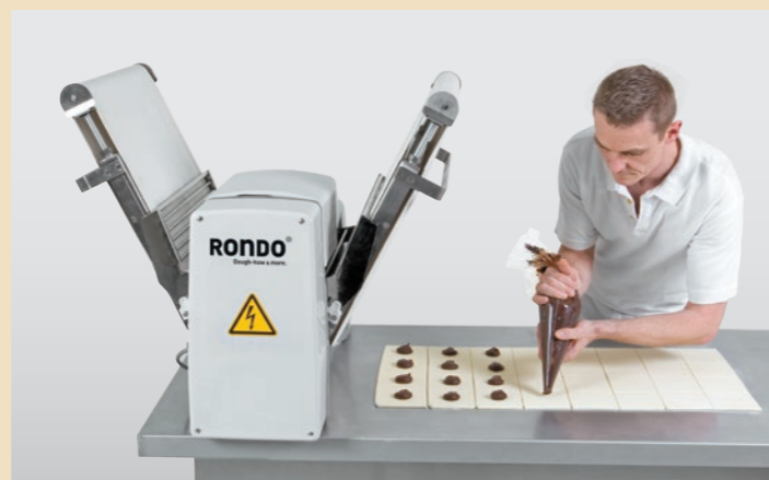
When not in use, the tables are simply folded up and you gain valuable working space.