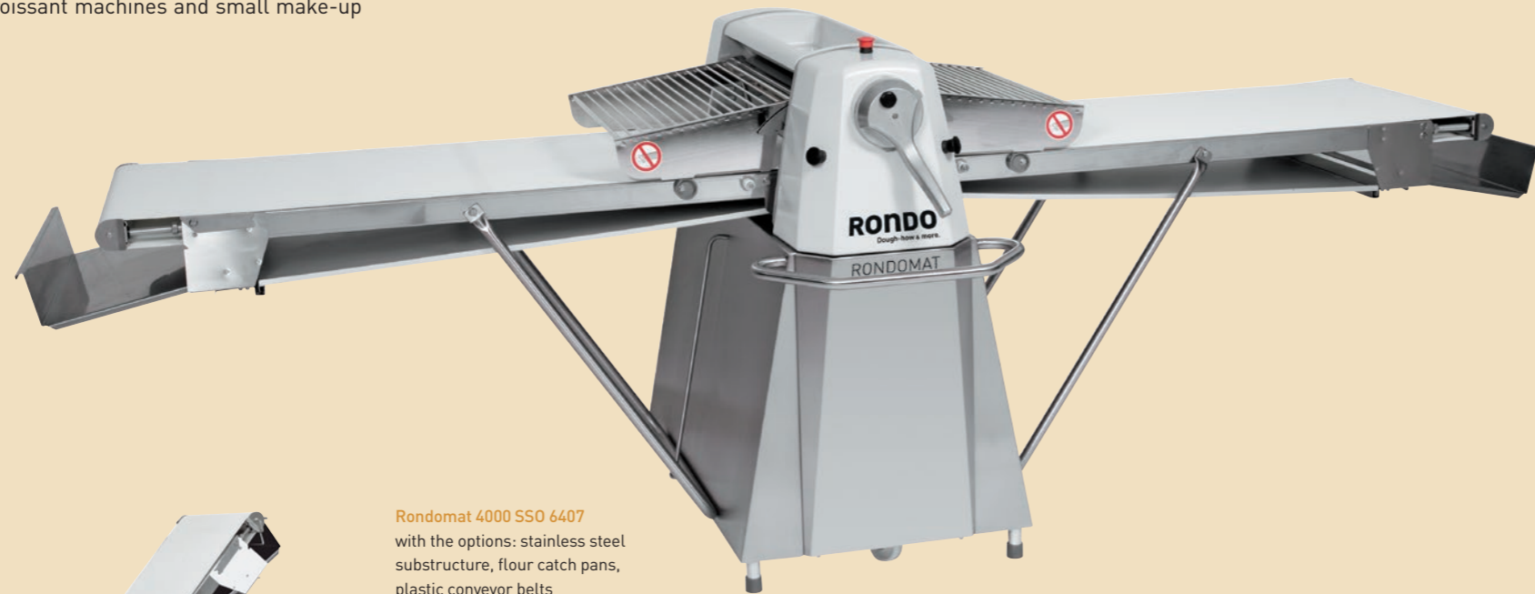
Rondomat 4000 SSO 6407 with the options: stainless steel substructure, flour catch pans, plastic conveyor belts

The Rondomat is the right dough sheeter for small to medium-sized bakeries. It features a rugged and ergonomic design. With the Rondomat, you process all types of dough gently to form consistent blocks and bands of dough. The working width of 650 mm even allows you to feed cutting tables, croissant machines and small make-up lines.