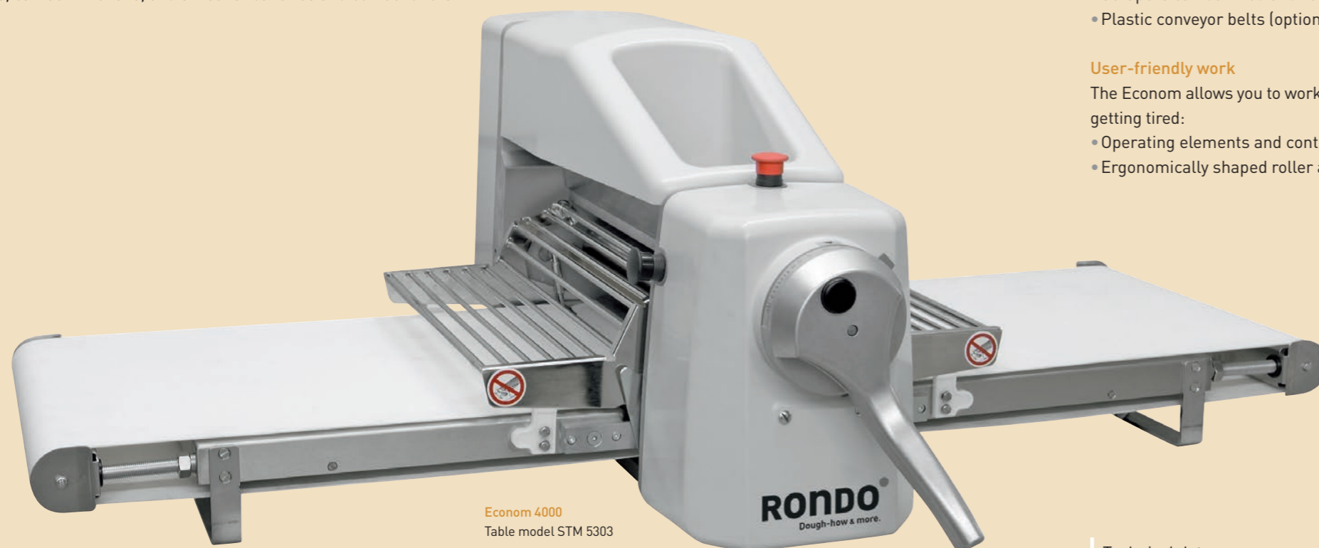
Econom 4000 Table model STM 5303

The Econom sheets dough gently and precisely and only uses a minimum of space. With its 500 mm working width, it is the ideal dough sheeter for narrow areas, for example in hotels, restaurants, pizza shops, canteen kitchens, and artisanal bakeries and confectioners.