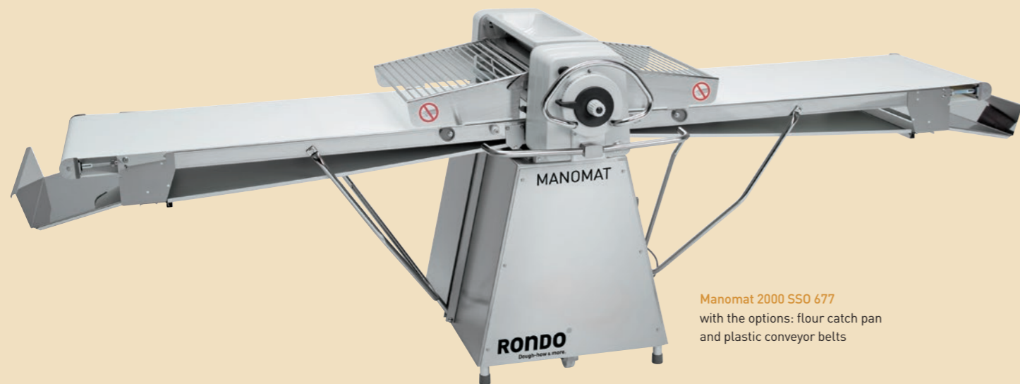
Manomat 2000 SSO 677 with the options: flour catch pan and plastic conveyor belts

With the Manomat and Automat, you quickly process particularly large quantities of dough. You can also work effortlessly in multiple shifts. Numerous elaborate details ensure maximum operator convenience. The design is extremely rugged and smooth surfaces made of stainless steel make cleaning simple.